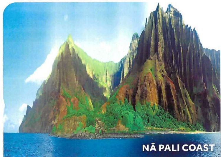
NĀ PALI COAST

Ride with us up the mountain to the 3,400-foot level and overlook Waimea Canyon, "The Grand Canyon of the Pacific." We promise a visual history along the way – Old Koloa Town, circa 1834, heart of Hawaii's first sugar cane plantation, and Waimea, the little town that grew up where Captain Cook first set foot in Hawaii in 1778. Follow the footsteps of Captain Cook along this memorable INCLUDED Kauai tour. The overlook at Opaekaa Falls is another stop that will surely secure your love of the Garden Island. Tour ends early afternoon and the ship remains docked in port overnight.