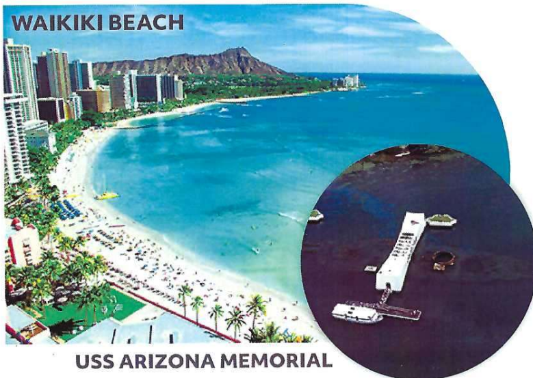
USS ARIZONA MEMORIAL

Today is yours to enjoy at your leisure. Book an optional excursion or kick back on the world-famous Waikiki Beach. Do as much as you want, or as little - the choices are endless, and the choice is yours!