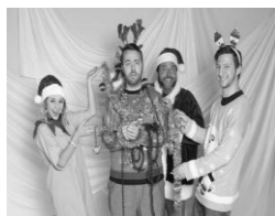
98% Nice, 2% Naughty