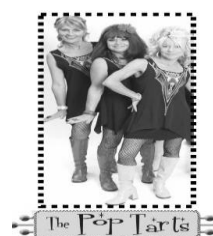
The Pop Tarts